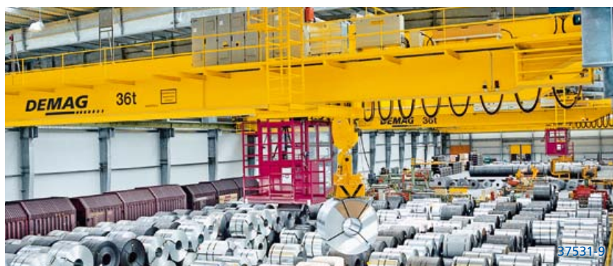
Three Demag Process Cranes fitted with coil magnets on one crane runway

In order to concentrate on its core business, the automotive industry is increasingly outsourcing processes to external suppliers, particularly for direct material deliveries to its production facilities.