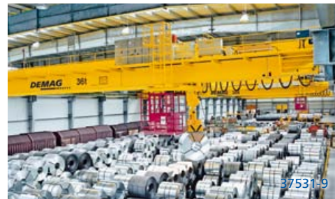
Coil handling and processing at Welser in Ybbsitz, Austria