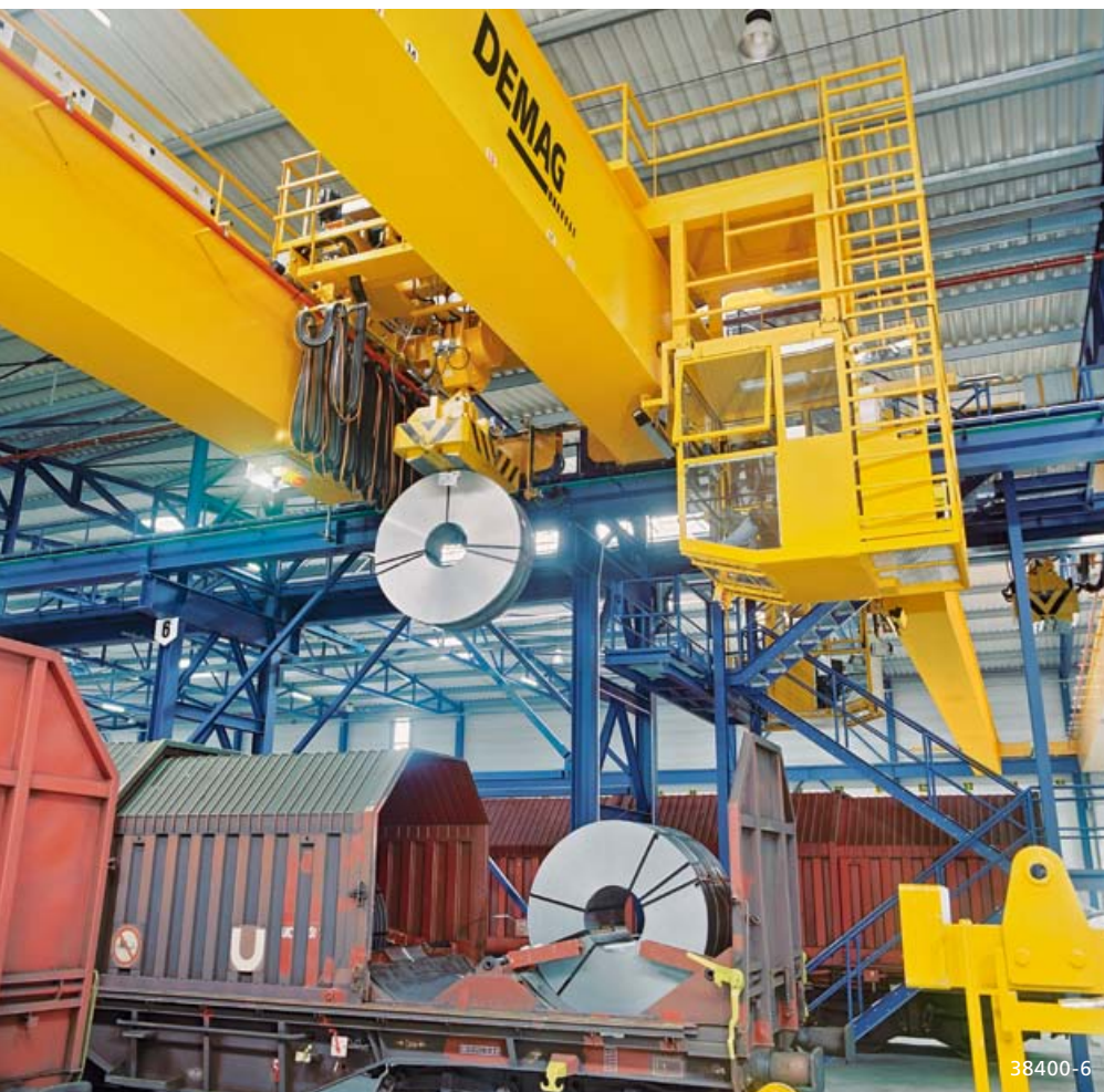
Coils being delivered by train in a steel service centre