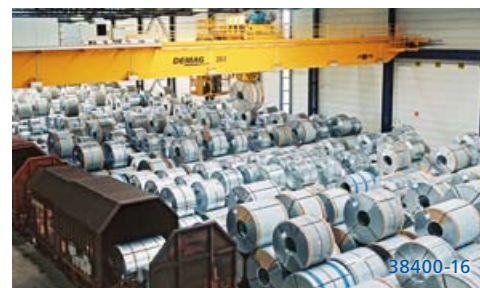
Just-in-time delivery to an automotive plant by Panopa in Wolfsburg, Germany