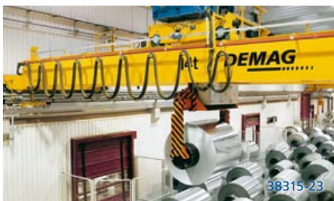
Automatic handling of aluminium coils at Pechiney Rhenalu in Rugles, France