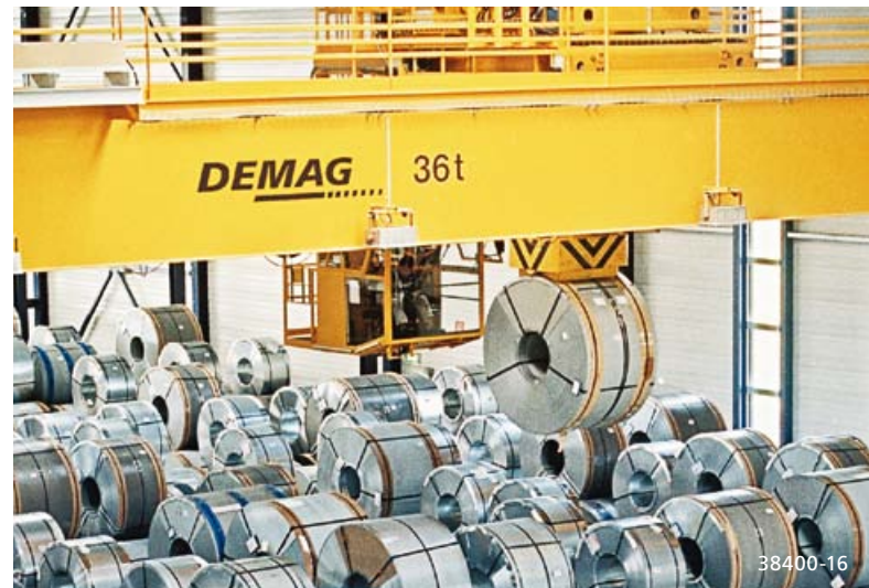
Optimum utilisation of existing storage capacity