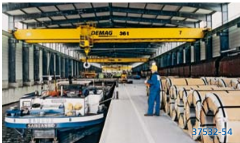
Goods being loaded and unloaded on ships, rail and trucks at ILL in Linz, Austria