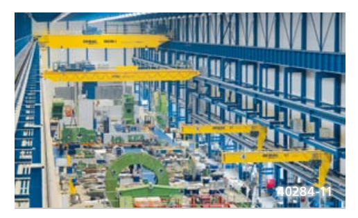
Heavy-load workshop with three crane levels at SMS Meer in Mönchengladbach