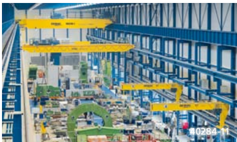
Heavy-load workshop with three crane levels at SMS Meer in Mönchengladbach