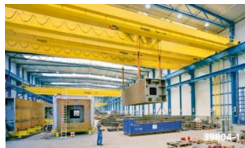
Standard and process cranes for the production of large-volume metal superstructures at Donges in Darmstadt