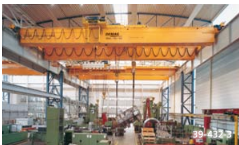
Siemens in Mülheim: Process cranes with turning function for the production of large turbines