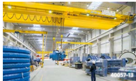
Equipment used in an assembly bay for offshore power stations at REpower in Bremerhaven