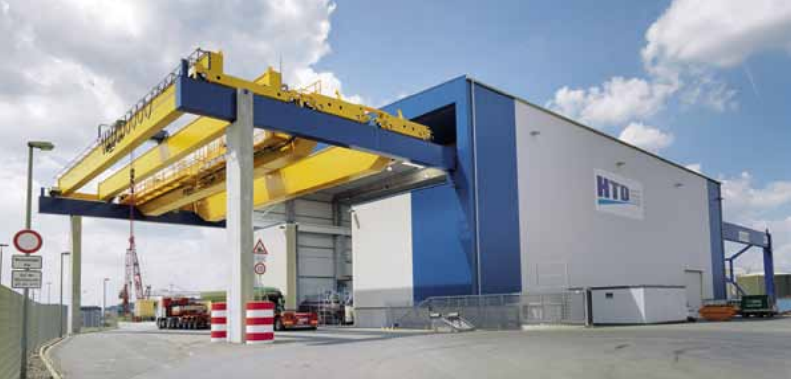
View of the terminal and rail connection from the shore

Starting recently, individual components from various suppliers are now also collected, packed and buffered in Duisburg for specific industry projects and then shipped direct to destinations all over Europe.