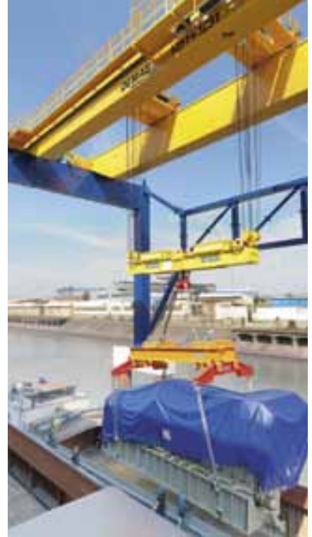
Barge being loaded in the Heavy Lift Terminal

new Heavy Lift Terminal Duisburg (HTD) and other freight-related logistics services, the decision was made to invest in crane systems. The same applies in the Nordhafen sector, where the range of services was extended from assembly and storage to logistics with the construction of a new packing bay.