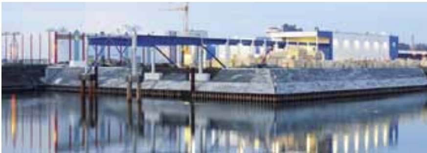
dpl packing building: the crane runway extends into the harbour basin