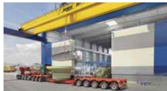
Heavy load trailers being unloaded at the Heavy Lift Terminal