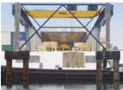
Fit for outdoor operation: ZKKE with two wire rope hoists

This building not only extends the possibilities for storing goods; its in-house crane capacities and the protected storage area also enable semi-finished and finished parts to be assembled and maintained. Two bridge cranes are installed in each of the three bays. A double-girder overhead travelling crane fitted with two 50 t hoist units travels in the first part of the building. By operating the hoists in tandem, this crane can also be used for transporting long materials. A 25 t ZKKE double-girder overhead travelling crane with a span of 22,000 mm also travels on the same runway. It offers lifting speeds from 0.3 to 5.3 m/min, cross-travel motions from 5 to 25 m/min and long-travel motions from 5 to 60 m/min. The 175 m-long crane runway in this building in the Nordhafen area also extends into the harbour basin. This enables ships to be loaded and unloaded direct and the area between the quay wall and the building can be fully utilised for storage. Both of the adjacent building areas are each equipped with identical 25 t double-girder overhead travelling cranes. Access for trucks was provided at the side of the building – parallel to the harbour basin – to allow goods to be loaded and unloaded on shore direct inside the building. The railway track passes through the building and ends at the quayside, which also facilitates trimodal handling in the Nordhafen sector.