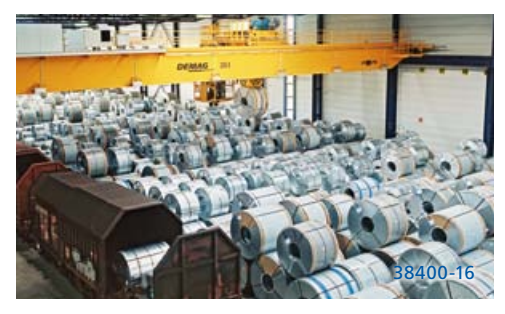
Just-in-time delivery to an automotive plant by Panopa in Wolfsburg, Germany