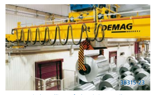
Automatic handling of aluminium coils at Pechiney Rhenalu in Rugles, France